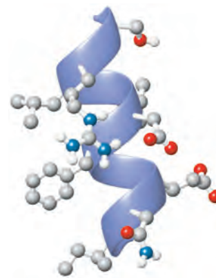
▲ Figure 4.11 View of a right-handed \alpha helix. The blue ribbon indicates the shape of the polypeptide backbone. All the side chains, shown as ball-and-stick models, project outward from the helix axis. This example is from residues Ile-355 (bottom) to Gly-365 (top) of horse liver alcohol dehydrogenase. Some hydrogen atoms are not shown. [PDB 1ADF].

Amphipathic helices are often located on the surface of a protein with the hydrophilic side chains facing outward (toward the aqueous solvent) and the hydrophobic side chains facing inward (toward the hydrophobic interior). For example, the helix shown in Figures 4.11 and 4.12 is on the surface of the water-soluble liver enzyme alcohol dehydrogenase with the side chains of the first, fifth, and eighth residues