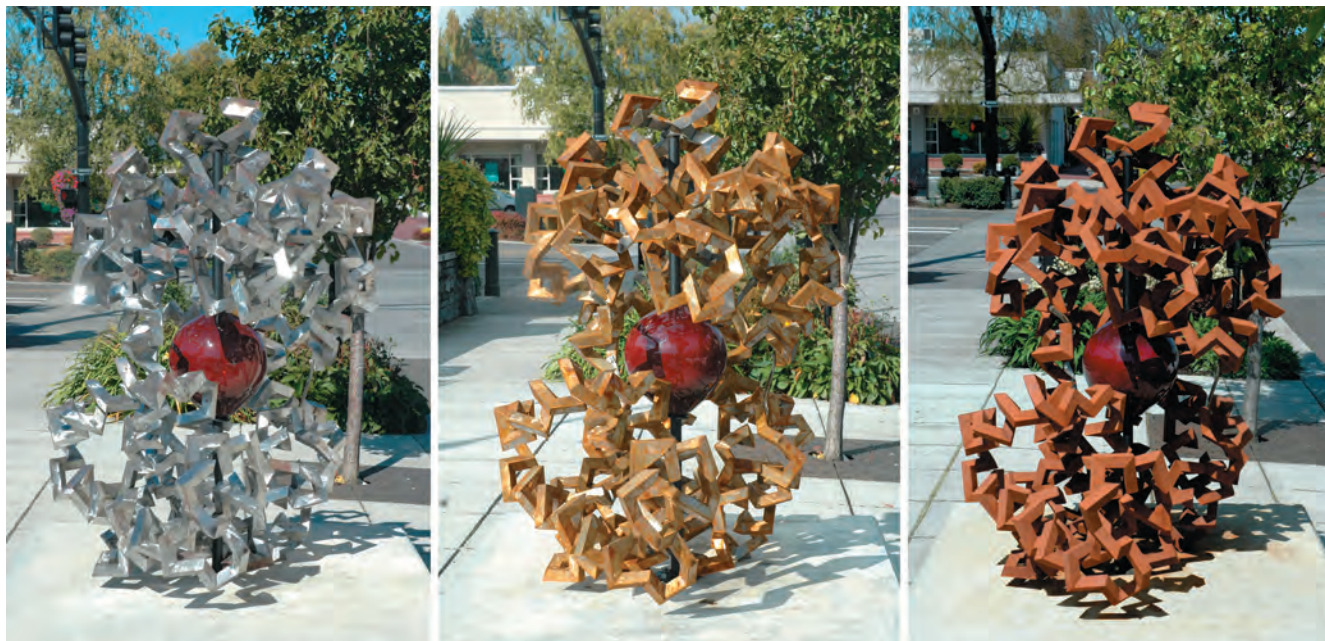
▲ Julian Voss-Andreae created a sculpture called “Heart of Steel (Hemoglobin)” in 2005 in the City of Lake Oswego, Oregon. The sculpture is a depiction of a hemoglobin molecule with a bound oxygen atom. The original sculpture was shiny steel (left). After 10 days (middle) it had started to rust as the iron in the steel reacted with oxygen in the atmosphere. After several months (right) the sculpture was completely rust colored.